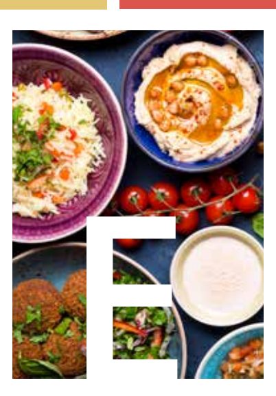
Flavors of Arabia Every Tuesday

Prices are subject to 10% Service Charge, 6% Tourism Fee & 4% municipality fee.